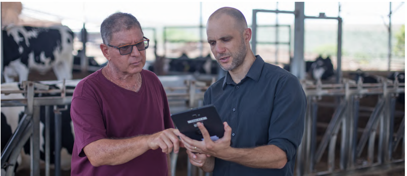
Kibbutz Gal-Ed, Israel

PV systems powered by the SolarEdge solution work together seamlessly to provide you with maximum power and efficiency while reducing your energy bills and dependency on your local utility grid.