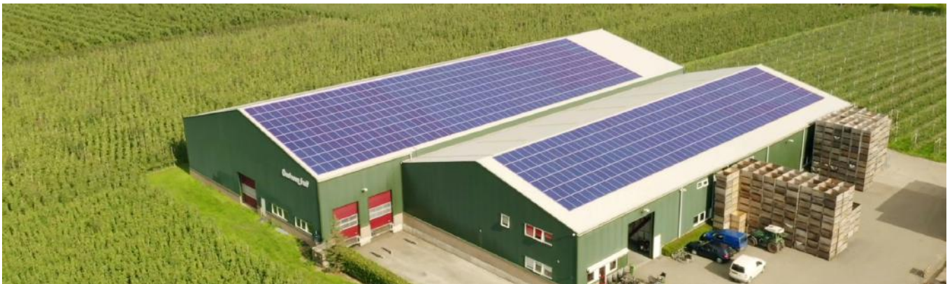
The SolarEdge system for the Oostveen Fruit Farm, The Netherlands, generated 285,660 kWh in the first year - 120% of the promised 237,946 kWh that was offered

With a SolarEdge smart energy system, you get the peace of mind that comes with choosing the world's #1 PV supplier with the best technology and longest warranties. SolarEdge Power Optimizers harvest more energy from each PV module, contributing to more power delivered over the system's lifetime for lower total cost of ownership (TCO). Your assets and structures are protected with innovative safety features like patented SafeDC™ functionality and arc-fault detection and interruption. And our module-level Monitoring Platform gives you a real-time snapshot of energy production and consumption on your smartphone or PC.