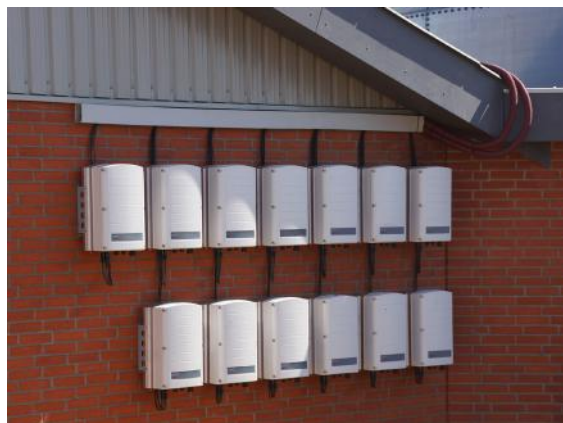
Sveigaard pig farm, Denmark